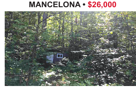
STATE LAND ACROSS THE STREET